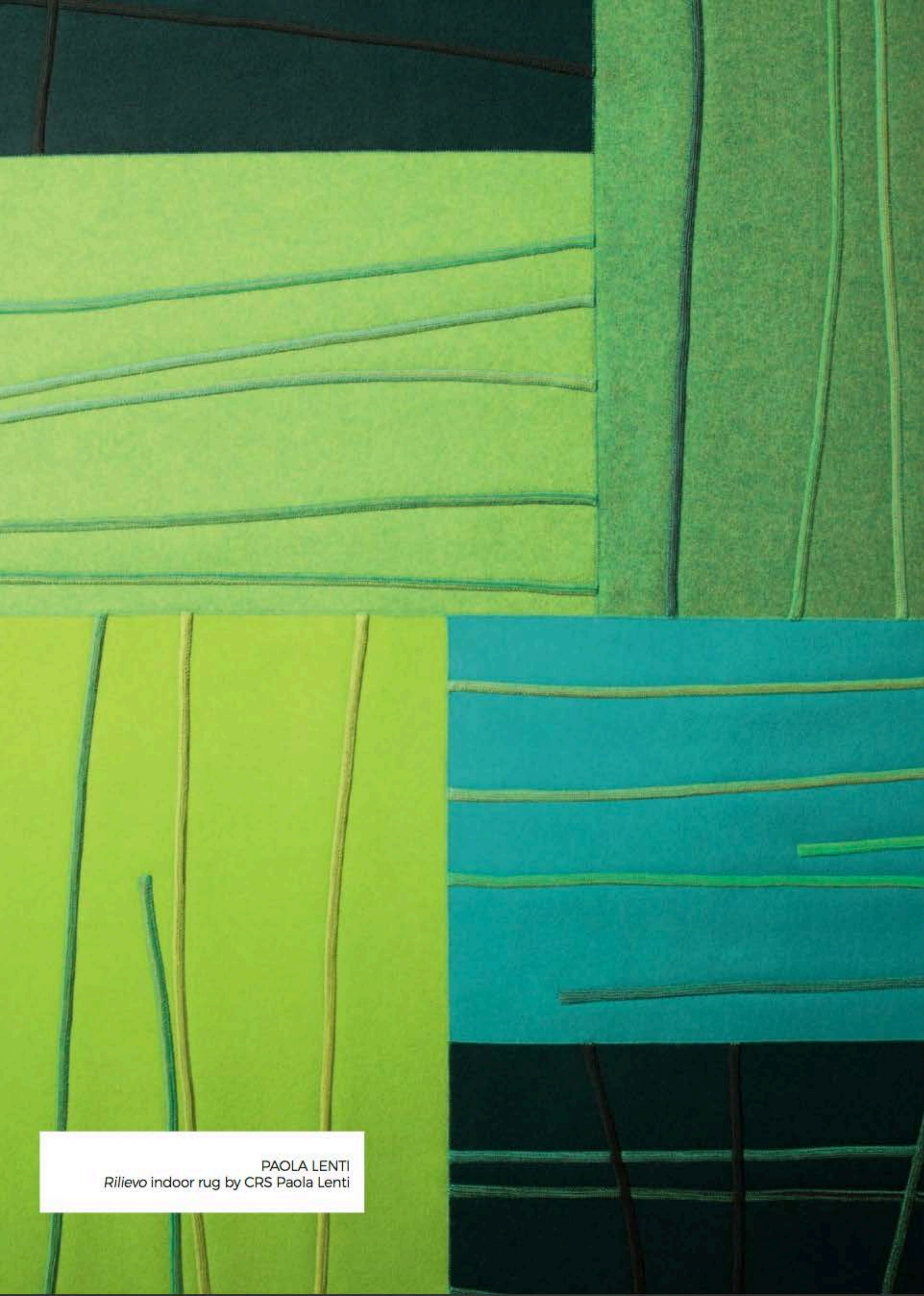
PAOLA LENTI Rilievo indoor rug by CRS Paola Lenti