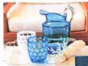
The appeal of tea: elegant glassware (above) and Portafino chair from Paola Lenti (right)