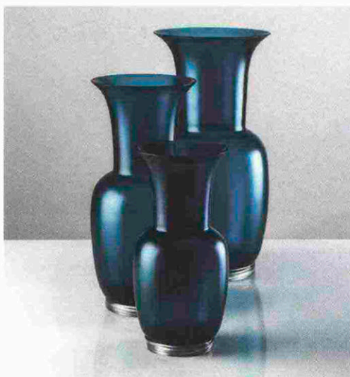
Venini - Collezione Satin. Vasi in vetro soffiato e lavorati a mano

The Pantone Color Institute has given its verdict: Classic Blue is the colour of 2020. Why are you going to love it? It is the ultimate austere and refined hue, elegant in its simplicity: a limitless blue that evokes the vast and infinite evening sky, that invites us to relax, to reflect, and restore your inner balance. Perfect for lending a touch of colour and making our homes even more comfortable yet at the same time glamorous.