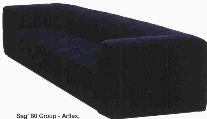
Sag' 80 Group - Arflex. Il divano componibile Strips, design Cini Boeri