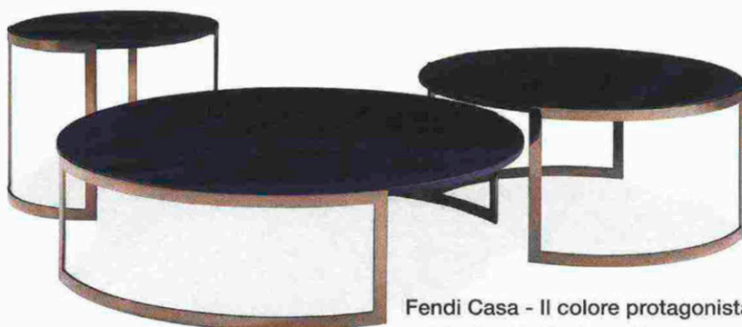
Fendi Casa - Il colore protagonista nei Coffee Table Anya Lite