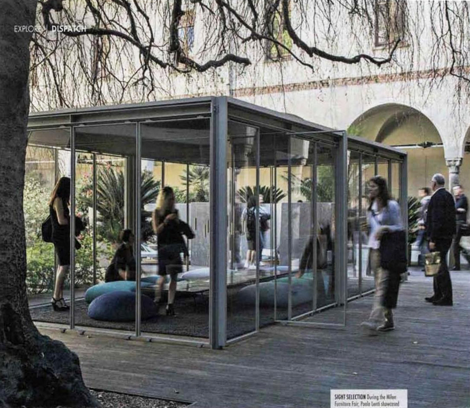
SIGHT SELECTION During the Milan Furniture Fair, Paola Lenti showcased her work using the grounds of the Chiostro dell'Umatorio.