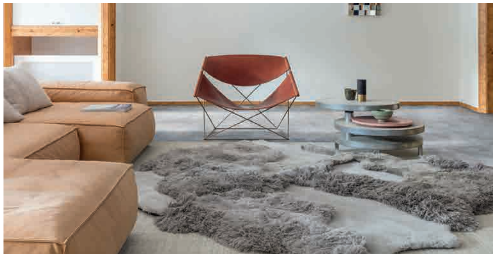
The warmth and cuddliness of Limited Edition's Cozy comes from the different lengths of wool yarns, up to 12cm. Visit: www.le.be