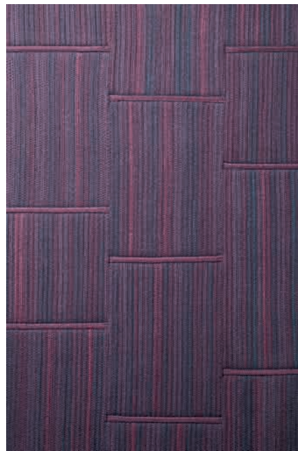
Paola Lenti uses wool cord in various ways in its Feltro and Natural collections, such as a wave pattern in Rio, intertwined in Flutti or sewn lengthwise in Incroci (pictured). Visit: www.paolalenti.it