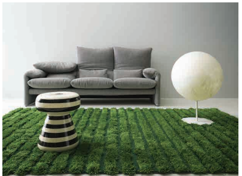
Kasthall's long pile Ines combines thick wool yarn with shimmering linen where shabbiness meets contrasting bouclé stripes for added volume and depth. Visit: www.kasthall.com