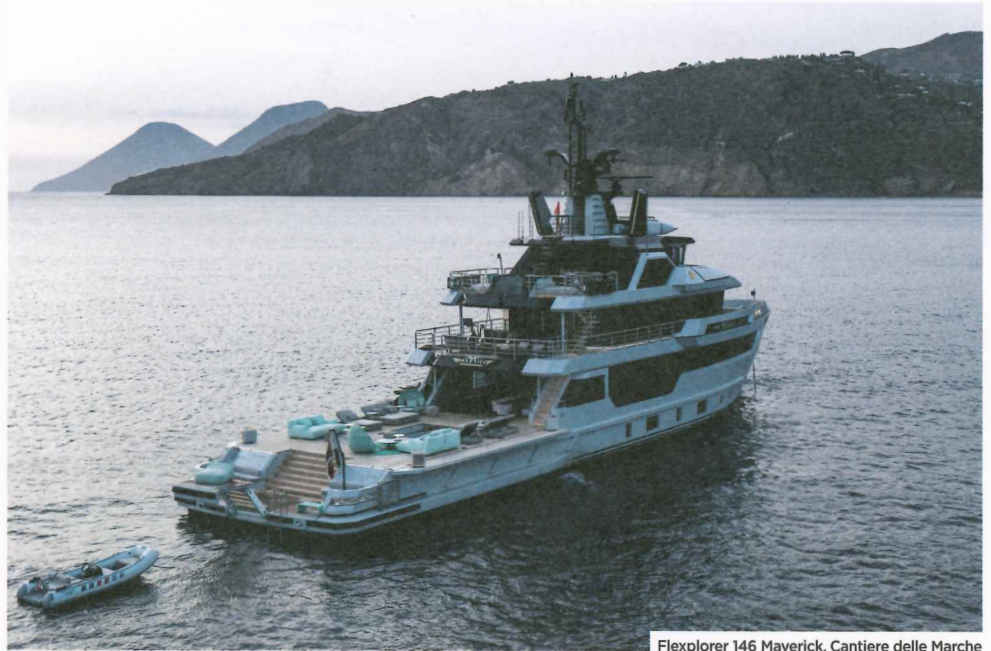
Flexplorer 146 Maverick, Cantiere delle Marche