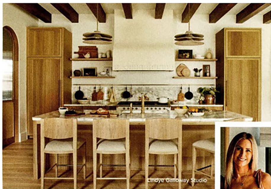
Lindye Galloway Studio