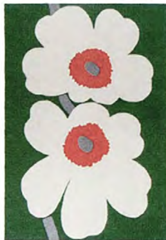
'Unikko' outdoor rug by Marimekko, £295, The Rug Seller (therugseller.co.uk)