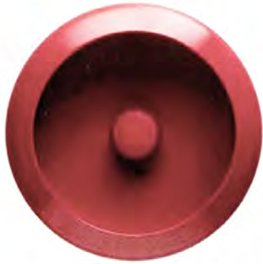
'Oloha' light, from approx £55, Fatboy (fatboy.com)