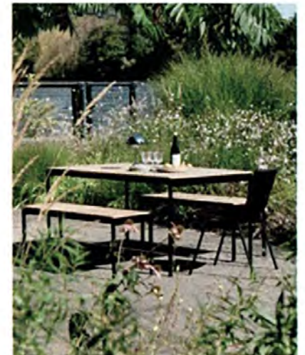
'Ville' benches, table and chair, £2,875 as seen, by Anderssen & Voll for &Tradition, Twentytwentyone (twentytwentyone.com) ▶