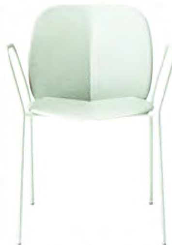
'Mentha' chair by Archirivolto Design, from £115, S-CAB (scabdesign.com)