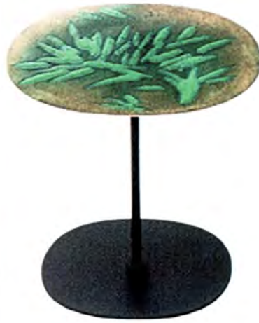
'Strap' side table by Victor Carrasco, from approx £2,520, Paola Lenti (paolalenti.it)