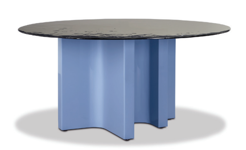
Dharma table by Studiopepe for Baxter baxter.it