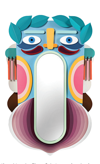
Grifo cabinet by Elena Salmistraro for altreforme imaestri.com